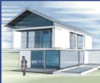
© by Michael Stehle for Boss Architektur